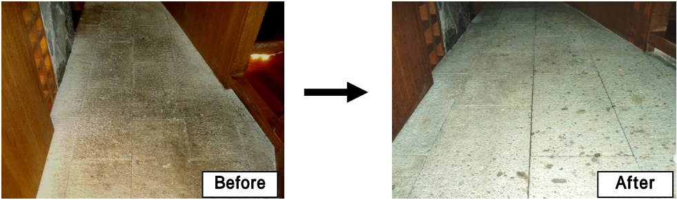
Dirt of inside floor on OHYA STONE