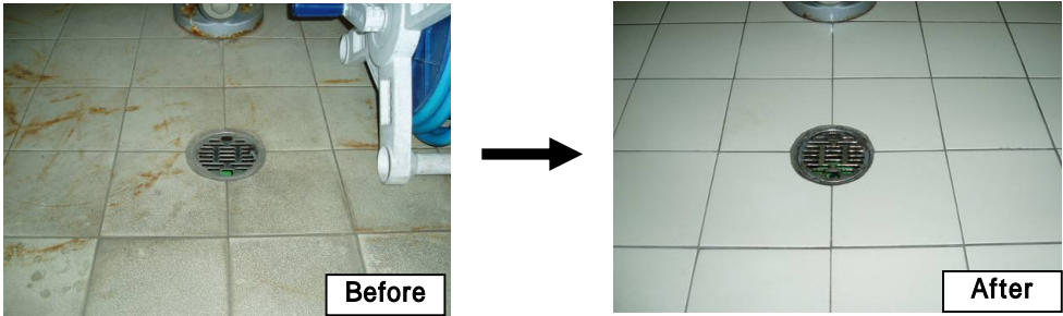
Fur of rest room to Tile